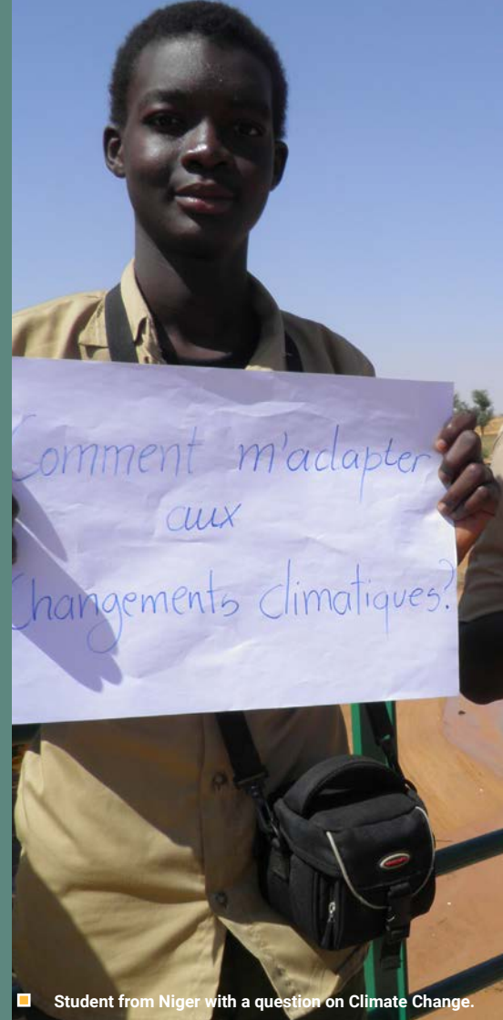
■ Student from Niger with a question on Climate Change.

Brainstorm with the students a set of questions they want to ask to their peers on other country circumstances and characteristics, but keep in mind that not all of them may be answered during the event.