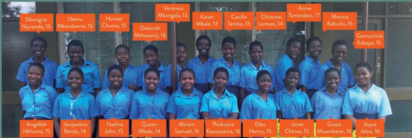
▣ Pupils from Lilongwe Girls School with name tags.