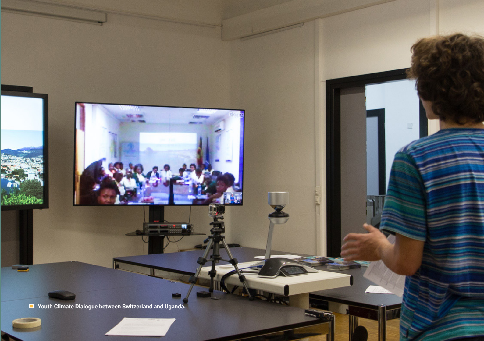
■ Youth Climate Dialogue between Switzerland and Uganda.